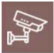
CC TV Camera Surveillance