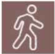
Walking Track on Roof