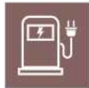
EV Charging Point