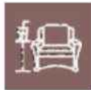
Waiting Lounge (Covered)